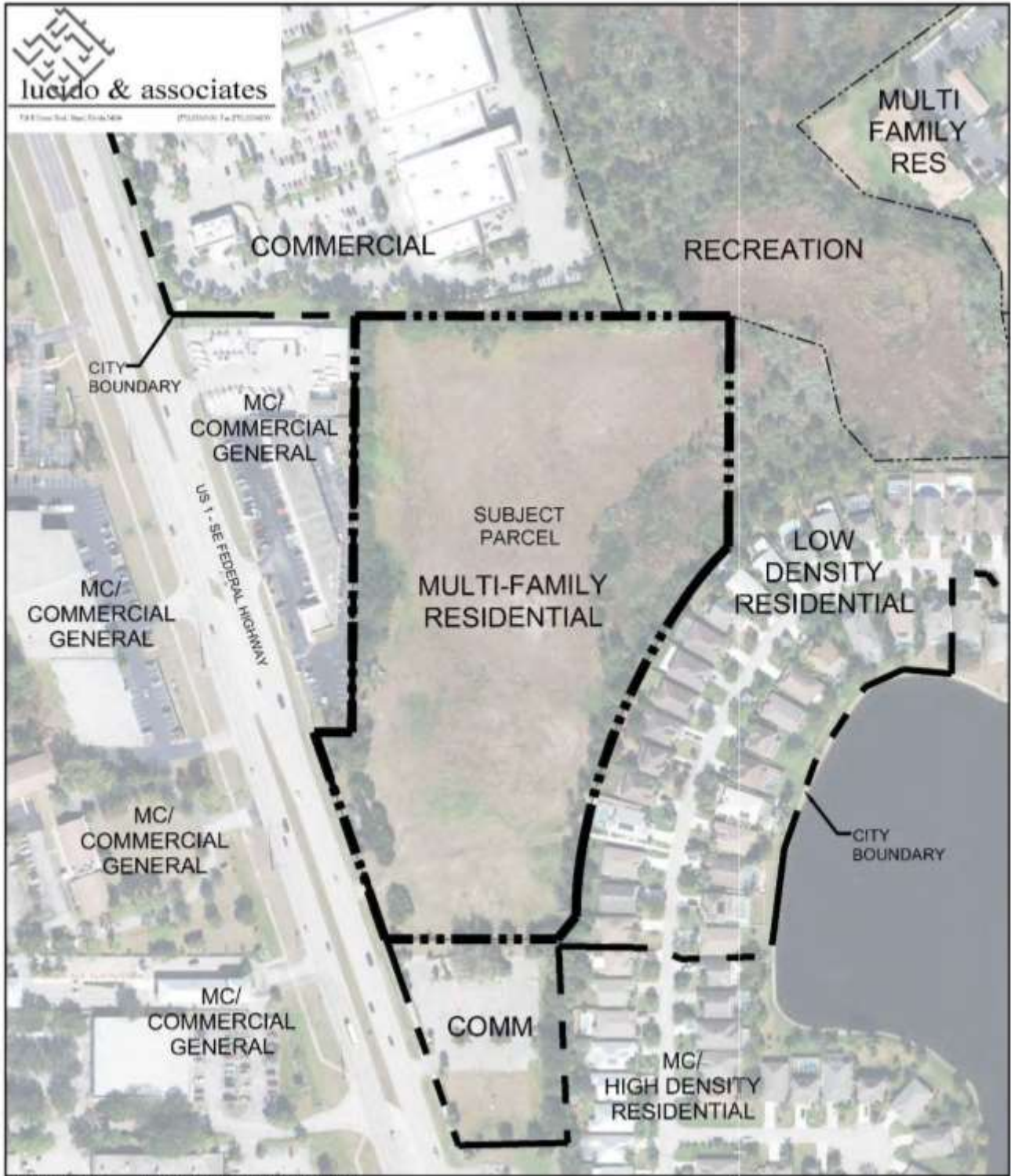
Exhibit 4 Proposed Future Land Use Map

Computer File Watermark - Master Exhibit Plan.dwg