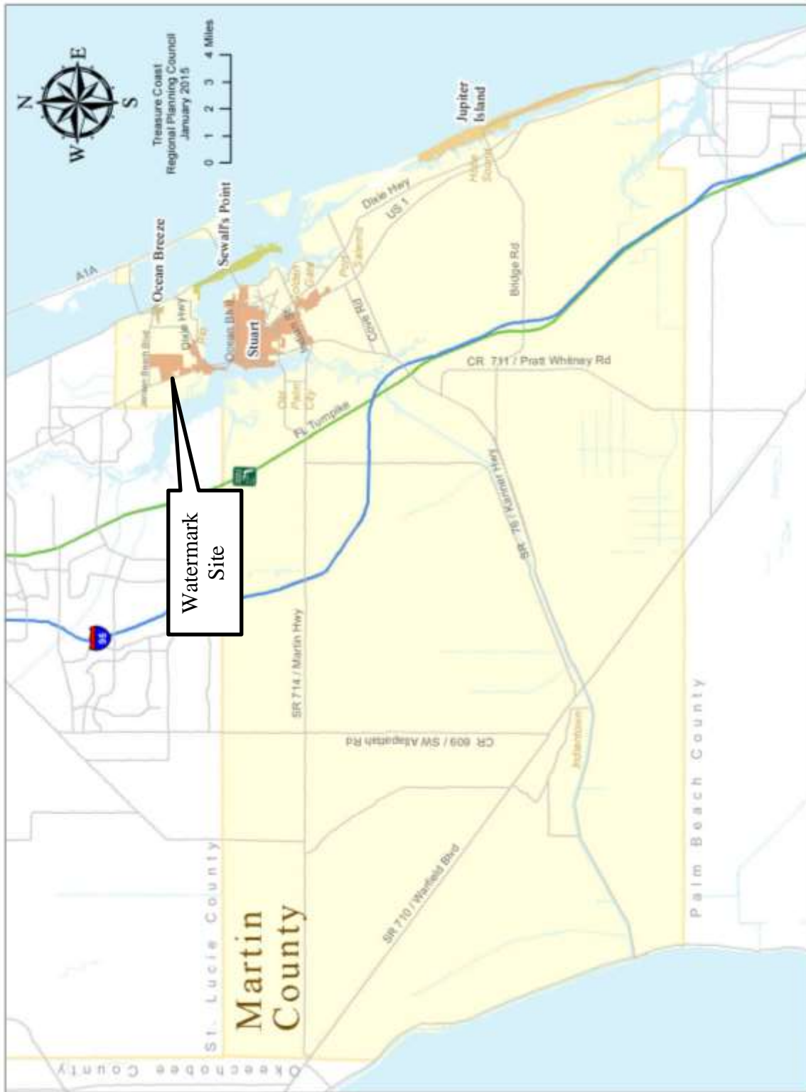
Exhibit 1 General Location Map